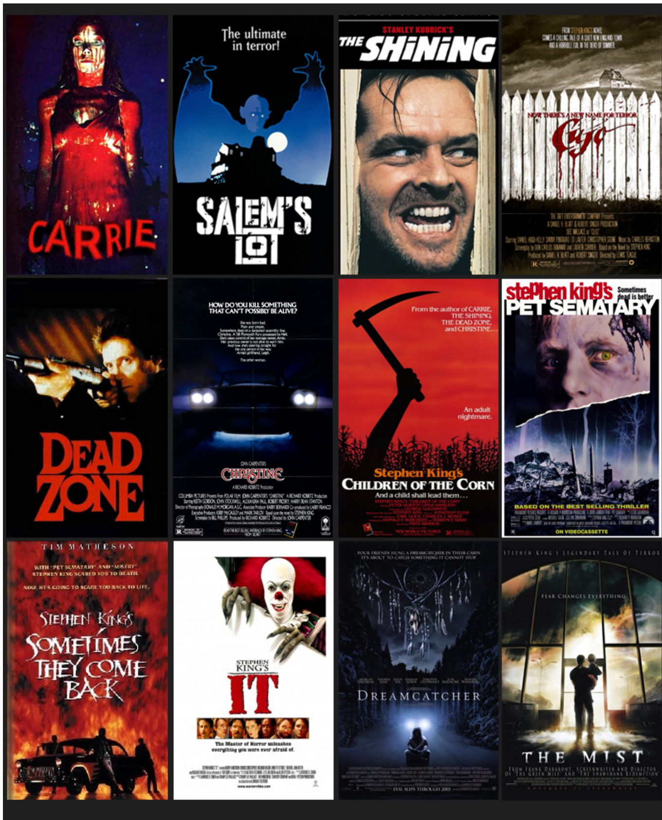
Stephen Kings Most Famous Books